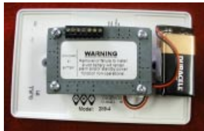
Battery Clip Recommended alkaline battery

The jumpers on JP1 are factory preselected. Alteration can effect timing and/or delay function.