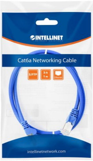
Model Shown: #741477