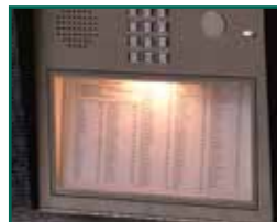
led lighted directory display