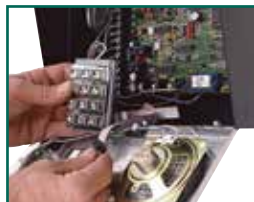
modular design makes installation and service easy