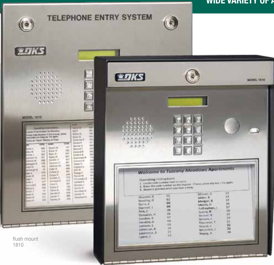
flush mount 1810

THE BUILT-IN DIRECTORY MAKES THE 1810 SUITABLE FOR A WIDE VARIETY OF APPLICATIONS AND IS EASILY UPDATED