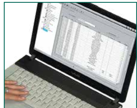
pc programmable Program the 1810 Access Plus from your PC