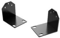
DW-G419RE 19" rack mount ears