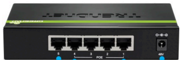
1 x Gigabit port 4 x Gigabit PoE+ ports Power