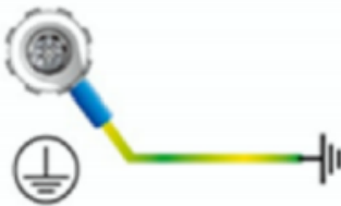
Figure 1: Socket-outlet protective earthing connection