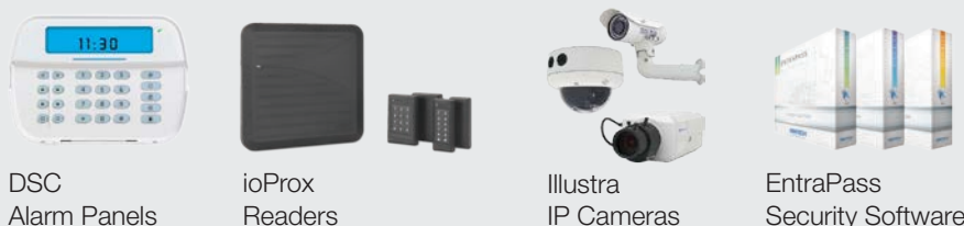
DSC Alarm Panels