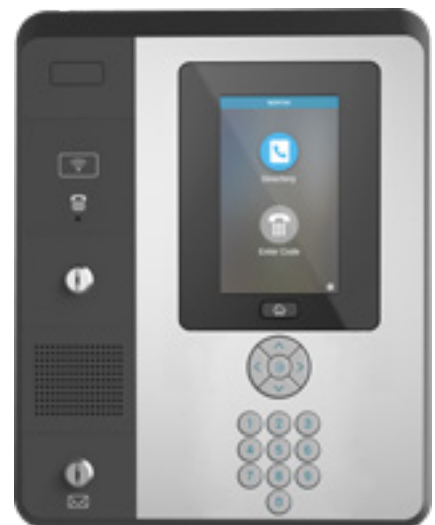
EntryPro EP-736 PN: 720-200736

Property Managers choose Linear® EntryPro for reliable value, low cost, and an embedded platform for telephone entry that offers all-weather reliability, easy management and scalability.