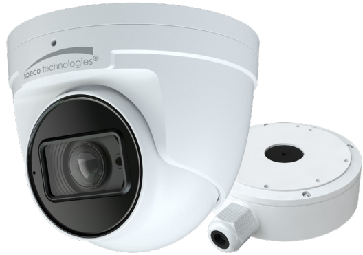
Junction Box Included