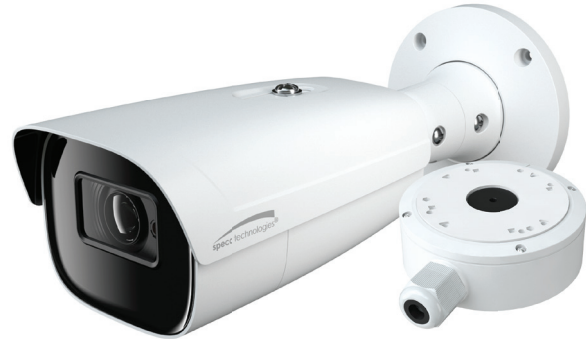
Junction Box Included