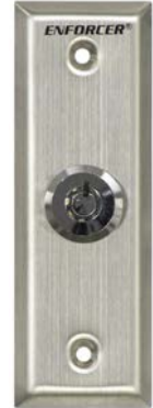
Slimline SD-71051-V0 SD-71002-V0