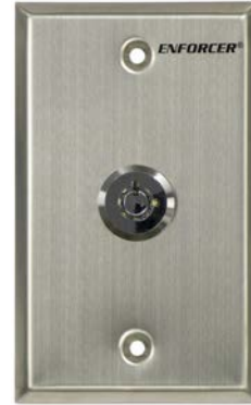
Single-gang SD-72051-V0 SD-72002-V0