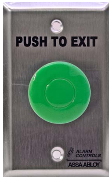
TS-14 Single Gang