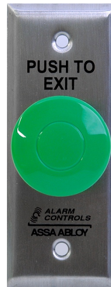
TS-14N 1.75" Wide

Pneumatic time delay operator does not require power for timing function.