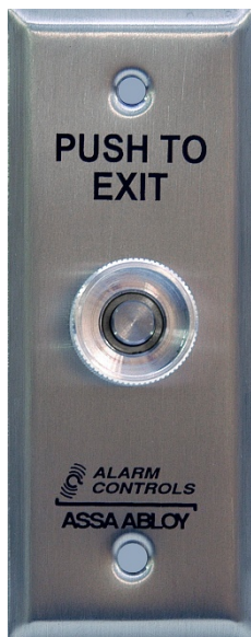
TS-15 1.75" Wide