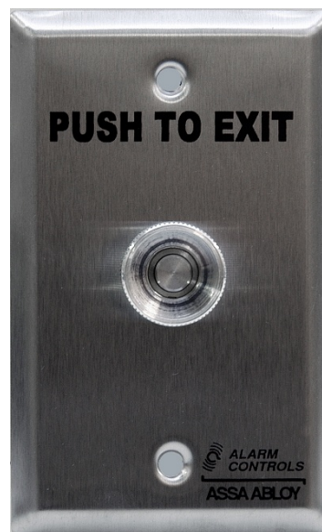
TS-16 Single Gang

Pneumatic time delay operator does not require power for timing function.