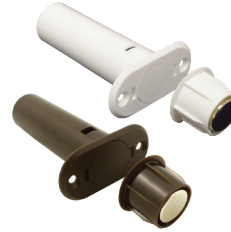
ELK-6023 (White) ELK-6023BR (Brown)