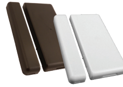
ELK-6021 (White) ELK-6021BR (Brown)